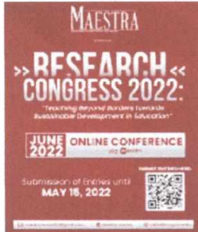
Maestra_Research Congress 2022 Poster.png 176K