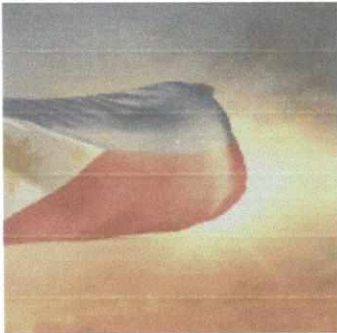
24 araw na lamang! .gif 11223K

This e-mail message, including any attached file, is confidential and legally privileged. It is solely for the intended recipient and if you received this e-mail by mistake, you should notify the sender immediately and delete this message from your system. You are further prohibited from disseminating, distributing or copying this e-mail. This e-mail cannot be guaranteed to be secure and error-free as it could be intercepted, corrupted, lost, destroyed, arrive late, or incomplete, or contain viruses or other malicious programs. The Company does not accept any liability for such improper, erroneous or delayed receipt of the e-mail or for the presence of such viruses and malicious programs. Any views, opinions or factual assertions contained are those of the author and not necessarily of the Company. The Company prohibits unofficial use of its email and consequently disclaims and accepts no liability for any damage caused by any libelous and defamatory statements transmitted via this e-mail.