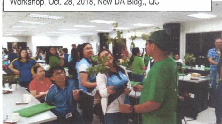
DepEd teachers in Metro Manila Sustainability Seminar & Workshop, Oct. 28, 2018, New DA Bldg., QC