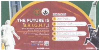
The Future is B.R.I.G.H.T. (Main Pub).png 1335K