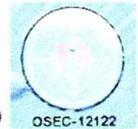
ARSENIO M. BALISACAN, PhD

Private sector organizations, on the other hand, are encouraged to take part and cooperate in the conduct of the various interagency NSM activities and coordinate organization-wide activities aiming at improving statistical knowledge and awareness. Whenever necessary, the PSA Undersecretary shall issue additional guidelines for the successful conduct of the NSM.