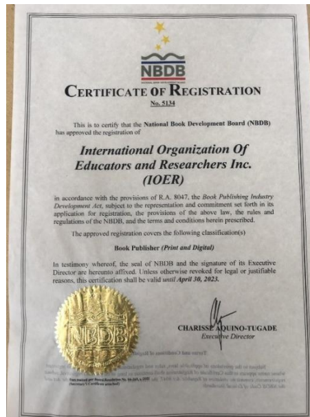
National Book and Development Board (NBDB) Certificate of Registration