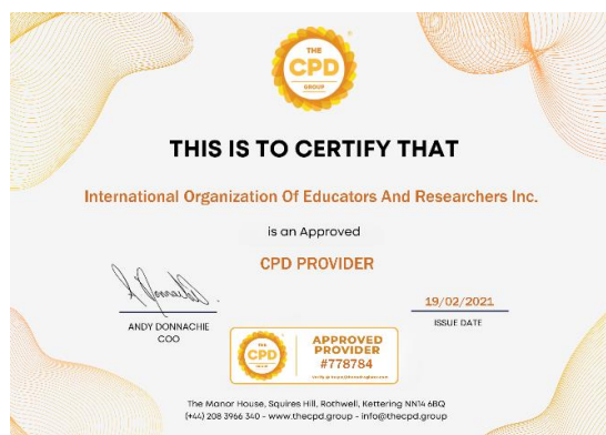
Accredited CPD Provider London, United, Kingdom

Office Address: Greenwood Subd. Pallocan Batangas City, Philippines Pisces St., Lourdes Subd., Bolbok, Batangas City, Philippines 43 Wiyung Indah I Blok A. Surabaya, East Java, Indonesia Email: info@ioer-worldresearch.org / internationalresearch8@gmail.com Telephone No. +639270782346 / +6281333563608 Website: www.ioer-worldresearch.org