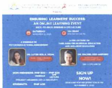
Nov. 11, 2023 poster.png 268K