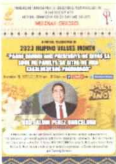
Session 2 - Nov. 18, 2023.jpg 679K