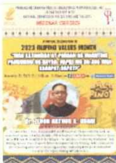
Session 4 - Nov. 25, 2023.jpg 696K