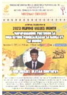
Session 1 - Nov. 11, 2023.jpg 698K