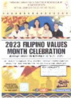
values month celeb pub mat.png 4348K