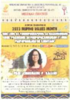
Session 3 - Nov. 18, 2023.jpg 725K