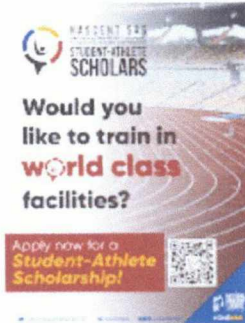
Poster 2.jpg 429K