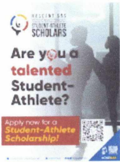
Poster 3.jpg 328K