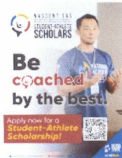
Poster 1.jpg 448K