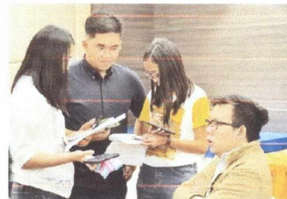
Learn what PH is doing vs. climate change

Villanueva, 16, is a communication arts student from Lycosum of the Philippines-Cavite.