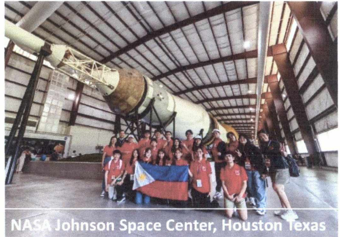
NASA Johnson Space Center, Houston Texas

Moreover, the Space Rocket Challenge involves building air-powered rockets, a task that introduces students to principles of aerodynamics and mechanical engineering. These activities not only build technical skills but also encourage critical thinking, problem-solving, and innovation—key competencies in modern education.