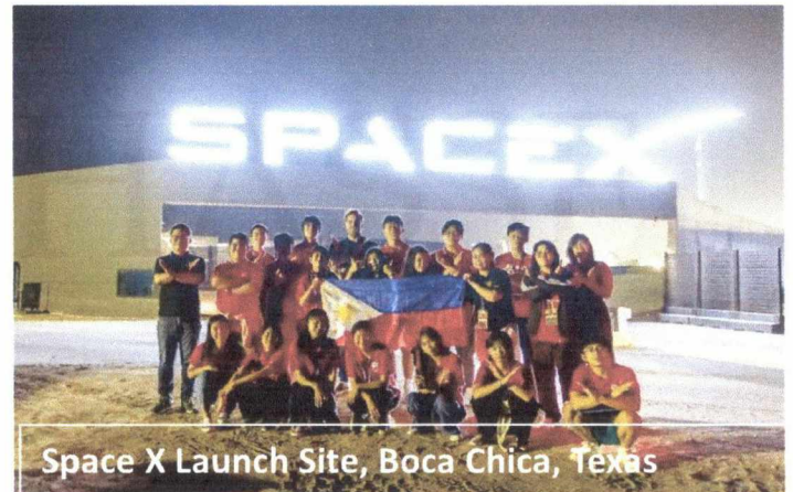
Space X Launch Site, Boca Chica, Texas