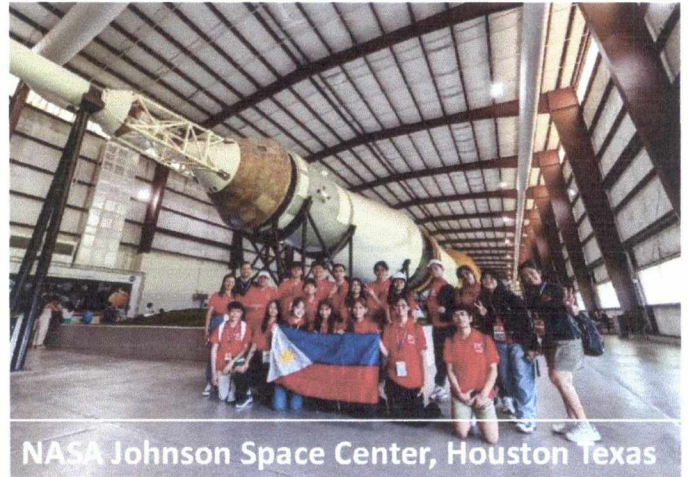
NASA Johnson Space Center, Houston Texas

Moreover, the Space Rocket Challenge involves building air-powered rockets, a task that introduces students to principles of aerodynamics and mechanical engineering. These activities not only build technical skills but also encourage critical thinking, problem-solving, and innovation—key competencies in modern education.