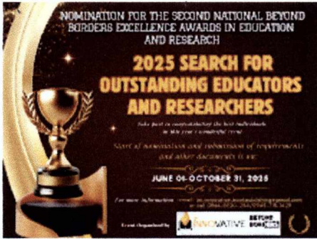
2025 SEARCH FOR OUTSTANDING EDUCATORS AND RESEARCHERS .png 1234K