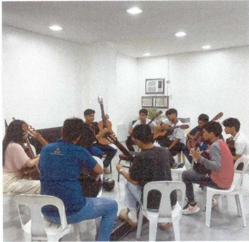
CCP KG Saturday Practice Sessions 8:00 AM - 11:00 AM