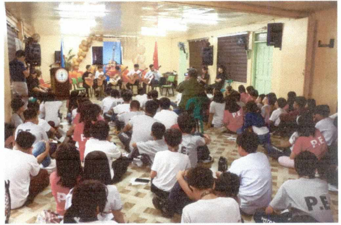
Lecture - performance for the Grade 7 & 8 students of Tambo National High School in Parañaque