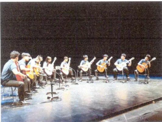
KG Ensemble, CCP Pasinaya Open House Festival, February 2, 2025