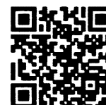
QR Code for pre-registration