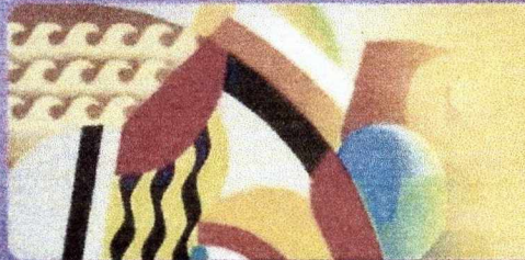
CIO REYES | Aton Wave Series 16, 2020

DIVE INTO THE UPDATED FRAMEWORK TO ENHANCE GENDER MAINSTREAMING AND GENDER-RESPONSIVE PLANNING, IMPLEMENTATION, AND EVALUATION